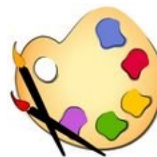
Sip and Paint (juice people, we drank juice!)