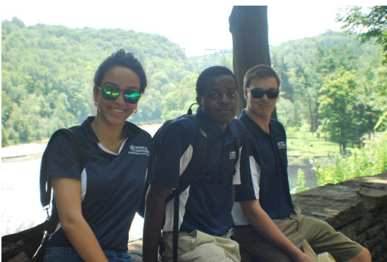
Summer 2015 Peer Mentors