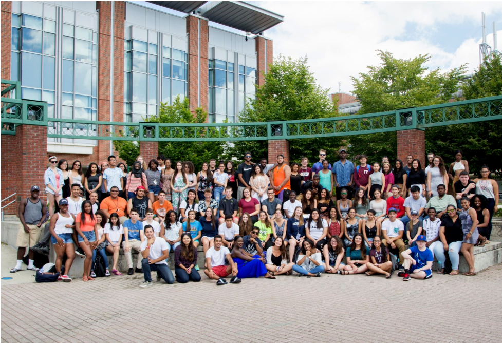
Summer Program 2016